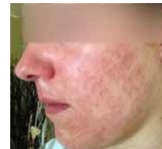
2 DAYS POST LASER

Analgesic and anti-inflammatory effects of A-PRP help to fight the pain and significantly improve the speed of wound healing after laser or chemical peel treatments.