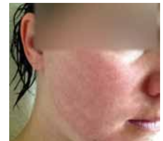
2 DAYS POST LASER + A-PRP