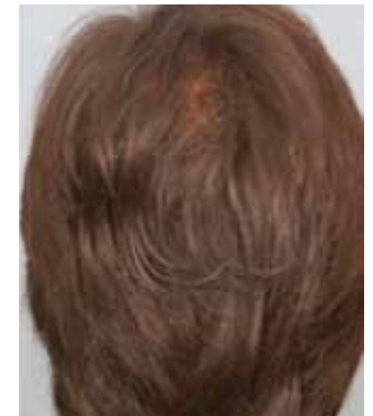
AFTER 3 treatments RegenACR Classic / Extra